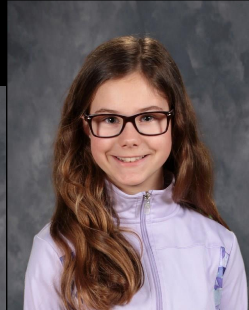
Fourth Place Perfect Attendance SECRETARY