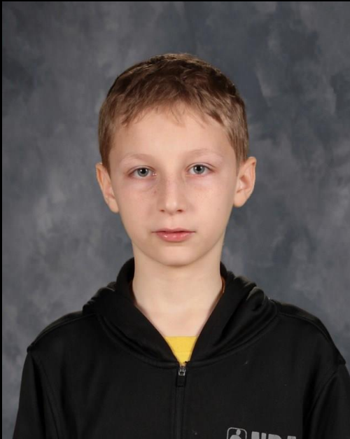
Second Place Perfect Attendance