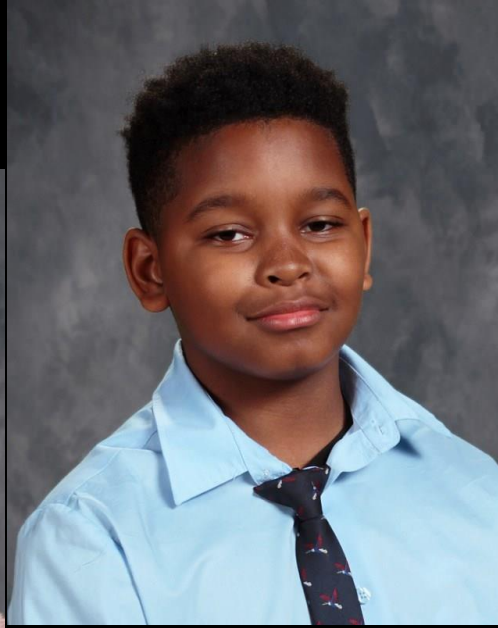
Second Place Perfect Attendance