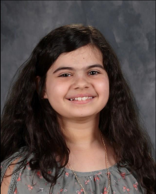
First Place Perfect Attendance