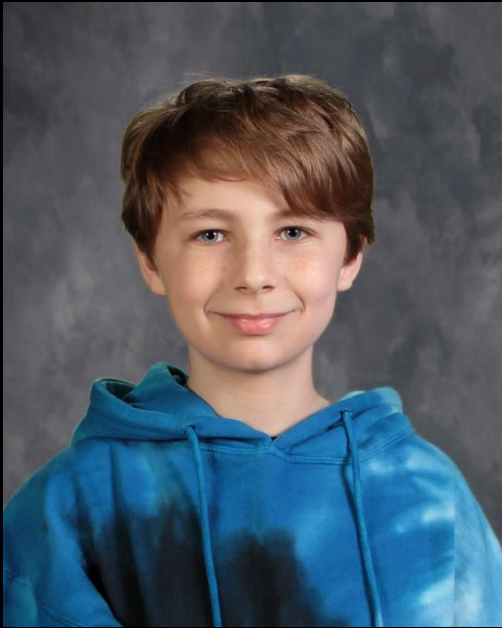
First Place PRESIDENT