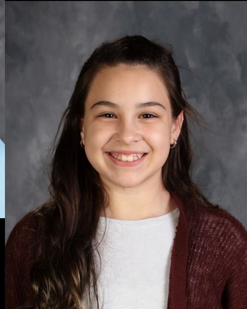
Third Place Perfect Attendance