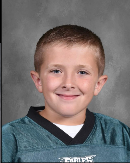
Second Place Perfect Attendance