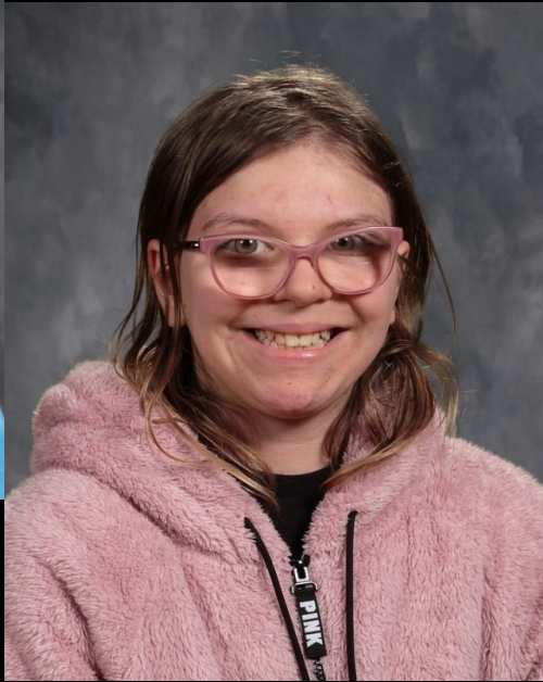
First Place Perfect Attendance